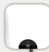
SUN2000L Inverter 5+5 years standard warranty Extendable up to 25 years