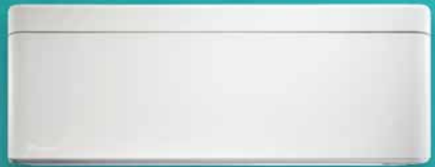
WHITE HAIRLINE FINISH